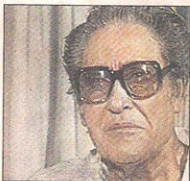
Ashok Kumar in Hum Log

I'm sure everyone will remember Dadamoni when they watch my show — Javed Akhtar