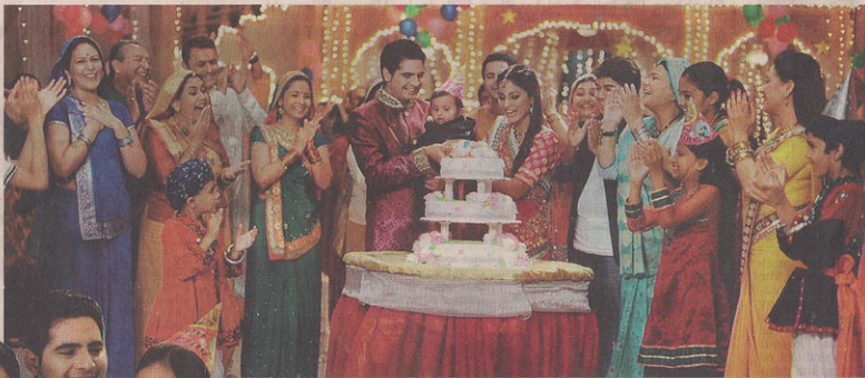
The cast of the show cuts the cake

N aitik and Akshara Singhania of Yeh Rishita Kya Kehlata Hai have many reasons to celebrate. To begin with, it's their son Naksh's first birthday. And then, their show completes 1,000 episodes. Actor Karan Mehra aka Naitik says, "We have become one big family and share a wonderful bond, which makes it fun working together. We will continue to deliver our best." Hina Khan, who plays Akshara, is equally excited. "I am happy to have embarked on this new journey in my life,